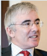
Lord David Freud DWP